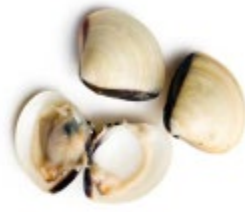
White Clams ( Meretrix lyrata )