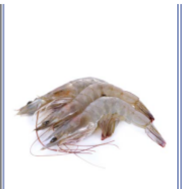
Vannamei Shrimp HOSO (Head On Shell On)