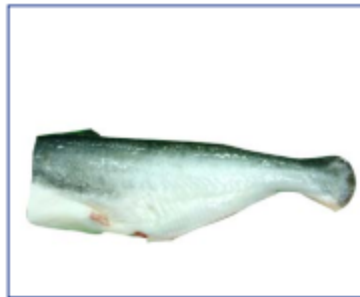
Pangasius HGT (Headless, Gutted, Tail Off)