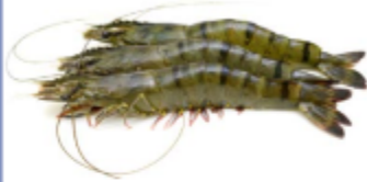
Black Tiger Shrimp HOSO (Head On Shell On)