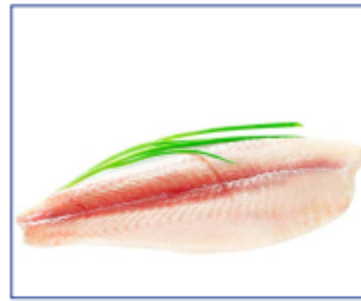
Pangasius Fillet Semi-trimmed