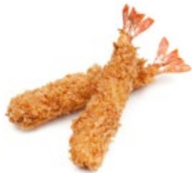
Breaded Torpedo Shrimp