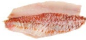
Red Mullet Fillet (Parupeneus heptacanthus)