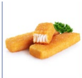
Breaded Pangasius Finger