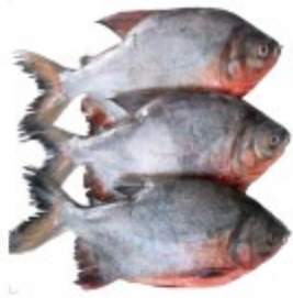
Red Pomfret ( Colossoma brachypomum )