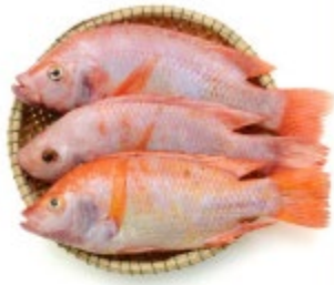
Red Tilapia ( Oreochromis spp. )