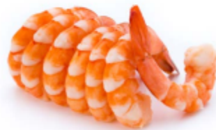
Black Tiger Shrimp Cooked PDTO (Peeled Deveined Tail On)