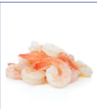
Vannamei Shrimp Cooked PDTO (Peeled Deveined Tail On)