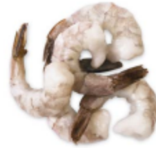
Black Tiger Shrimp Raw PDTO (Peeled Deveined Tail On)