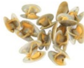
Yellow Clam Meat ( Paphia undulata )