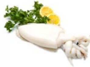
Whole Cleaned Cuttlefish (Sepia spp.)