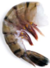
Black Tiger Shrimp HLSO (Headless Shell On)