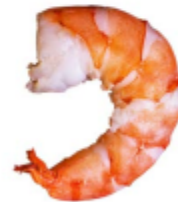
Black Tiger Shrimp Cooked PD (Peeled Deveined Tail Off)