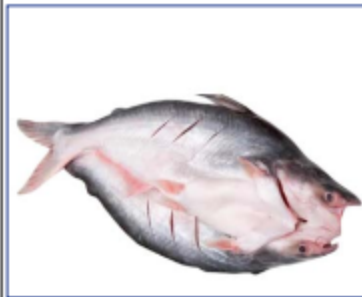
Pangasius Butterfly Cut