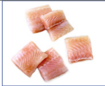
Pangasius Cube Untrimmed