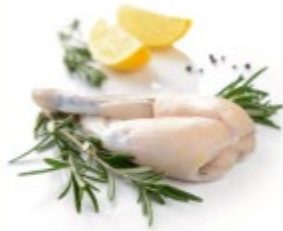
Frog Legs ( Hoplobatrachus rugulosus )