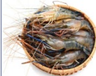
Fresh Water Scampi ( Macrobrachium rosenbergii )