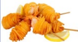
Potato Wrapped Shrimp