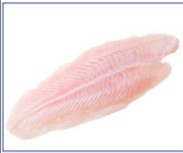
Pangasius Fillet Well-trimmed