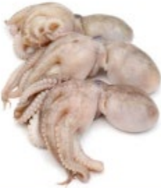
Baby Octopus (Octopus vulgaris)