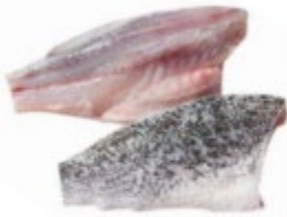
Barramundi Fillet ( Lates calcarifer )