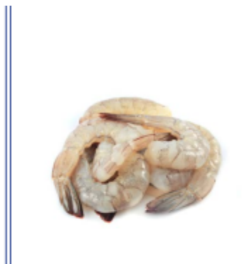
Vannamei Shrimp Raw PDTO (Peeled Deveined Tail On)