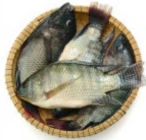
Black Tilapia ( Tilapia nilotica )