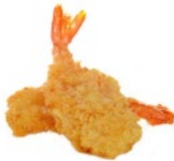
Breaded Butterfly Shrimp