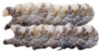
Black Tiger Shrimp Raw PD (Peeled Deveined Tail Off)