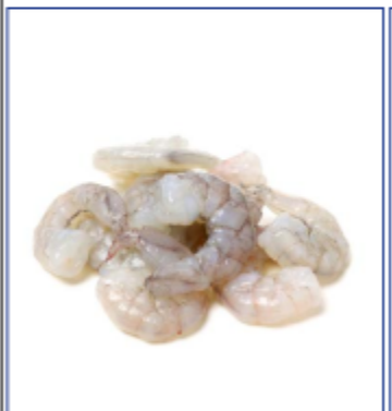
Vannamei Shrimp Raw PD (Peeled Deveined Tail Off)