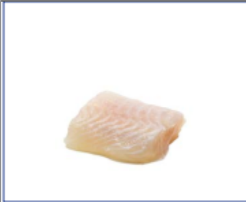
Pangasius Cube Well-trimmed