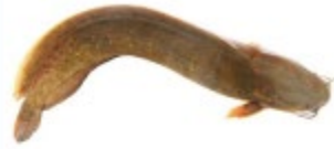
Yellow Catfish ( Clarias macrocephalus )