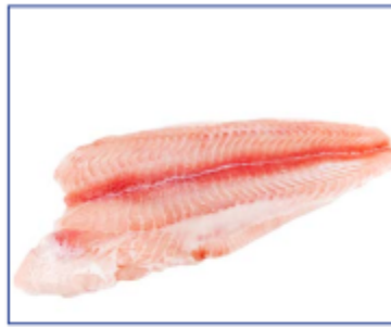
Pangasius Fillet Untrimmed