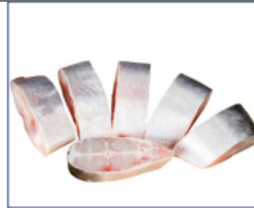
Pangasius Steak/ Chunk