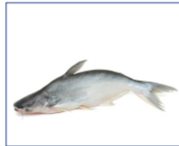
Pangasius Whole Round