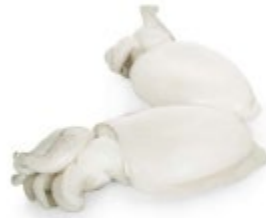
Baby Cuttlefish (Sepia spp.)